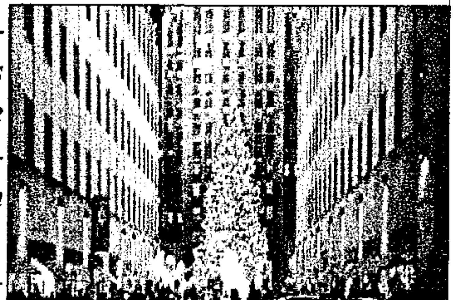
Be sure to see the Christmas Tree at Rockefeller Center

After breakfast, on your own, our drop off & departure point will be the Hilton Hotel in the Rockefeller Center area on Avenue of the Americas (6th Avenue) between 53rd & 54th Sts (close to Rockefeller Center). Your Tour Director will provide you with a variety of information for your day in "The Big Apple". You will have a map to help you get around in addition to information on Museums, Department Stores, Sightseeing, Broadway Shows, Restaurants and more. We arrive at Rockefeller Center area and drop off near the Hilton Hotel in New York City approximately 8:15—8:30 AM. Spend the day as you wish...shopping the various famous Department stores, explore the variety of museums, see a Broadway Matinee, sightsee to the Statue of Liberty & Ellis Island, or just walk around and enjoy New York's special atmosphere. New York has always been the all American City and you'll find the friendly New Yorkers welcoming you to their city. Your lunch & dinner will be on your own in New York's myriad of restaurants. Departure for home will be at 8:30 PM this evening.